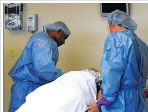
PETRI DISH: Doctors, nurses, medical students and other health care professionals learn about the latest surgical procedures with the aid of donor bodies and human patient simulators at the Medical Education & Research Institute in Memphis.

"They are doing hands-on training and are actually going to simulate a bombing disaster,"